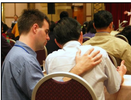
Bringing the heart of God to the heart of man