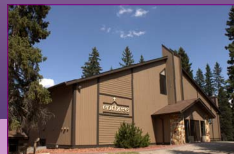
ENTHEOS RETREAT CENTRE Calgary, Alberta, Canada

Two to eight weeks of essential and practical training covering the core elements of healing and discipleship ministries